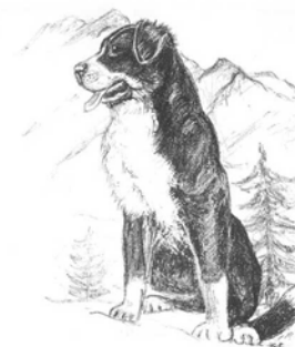
Bernese Mountain Dog

Paintings and drawings of the time depicted the breed's look, environment and purpose.